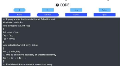
Figure 3: Code presentation of a sort

Once the sorting is complete, the application would display the sorted array along with the number of swaps and comparisons made during the process. The proposed system could also include additional features such as multiple sorting algorithm options, color-coding for visual emphasis, user-friendly controls for customization, also code traverses along with the sorting bars.