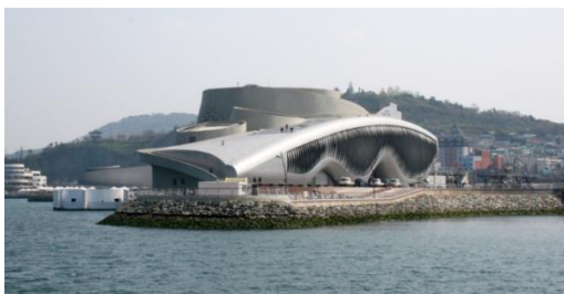
Fig 1: South Korea's Thematic Pavilion and its inspiration from Strelitzia Reginae 's movements.

Behavioral biomimicry, meanwhile, examines how organisms respond to environmental stimuli. A notable example is the efficient thermoregulation observed in termite mounds (figure 2), which has inspired buildings in Western Australia. These structures employ strategic orientation and internal air circulation, similar to termite mounds, to maintain stable temperatures [24].