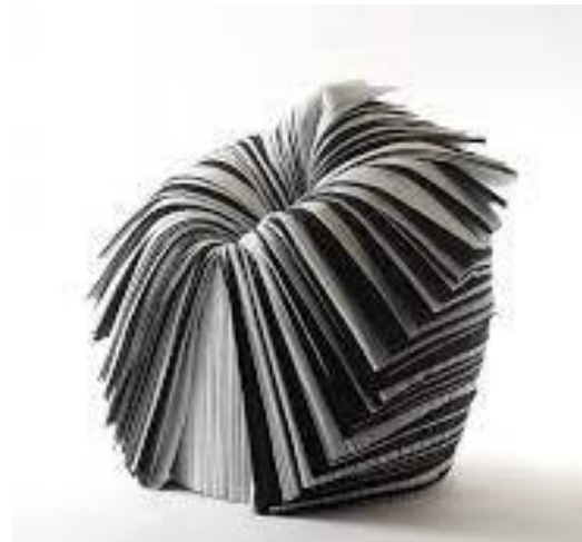
Fig 3: Nendo's Cabbage Chair, created by Japanese designer Oki Sato

showcasing how biomimicry can lead to furniture that is both comfortable and visually engaging.