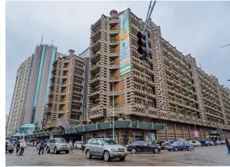
Fig 2: Termite mound-inspired thermoregulation in Western Australia's buildings.

At the ecosystem level, biomimicry focuses on the intricate interactions within natural systems. In lighting design, biomimetic principles have led to innovative solutions that consider the impact of light on human well-being and environmental balance. Inspired by the anthurium and spook fish, designers have incorporated symmetrical mirrors in atrium spaces for effective light collection and distribution [25].