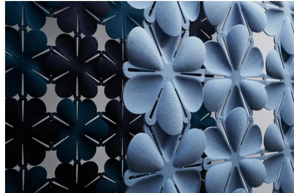
Fig 5: 'Bloom' acoustic panels by Stone Designs

Another notable instance is the 'Bloom' acoustic panels by Stone Designs [41]. Inspired by the shape of blooming flowers, these panels not only enhance the aesthetic appeal of interior spaces but also mimic the sound-absorbing qualities of certain plant structures, contributing to improved acoustics in interior environments.