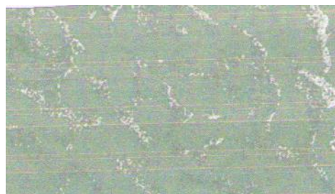
Figure 2. 15 parts by mass prepared using recycled high-density PE macrostructure of bitumen at 180^{\circ}\text{C}

6% by mass of recycled high-density polyethylene