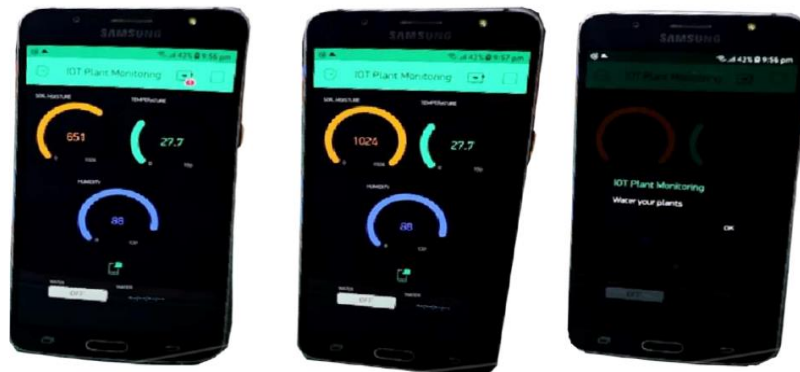
Figure 3: The storage and visualisation of data in the cloud using IoT technology.

IoT. The temperature sensors detect the field temperature and subsequently present it in degrees Celsius. The moisture sensor is used to continuously analyse the quantity of water in the field. Farmers are not need to be physically present at the irrigation field, as the condition of the system (as shown in Figure-3) may be monitored remotely by the user through our IoT-based smart irrigation system application.