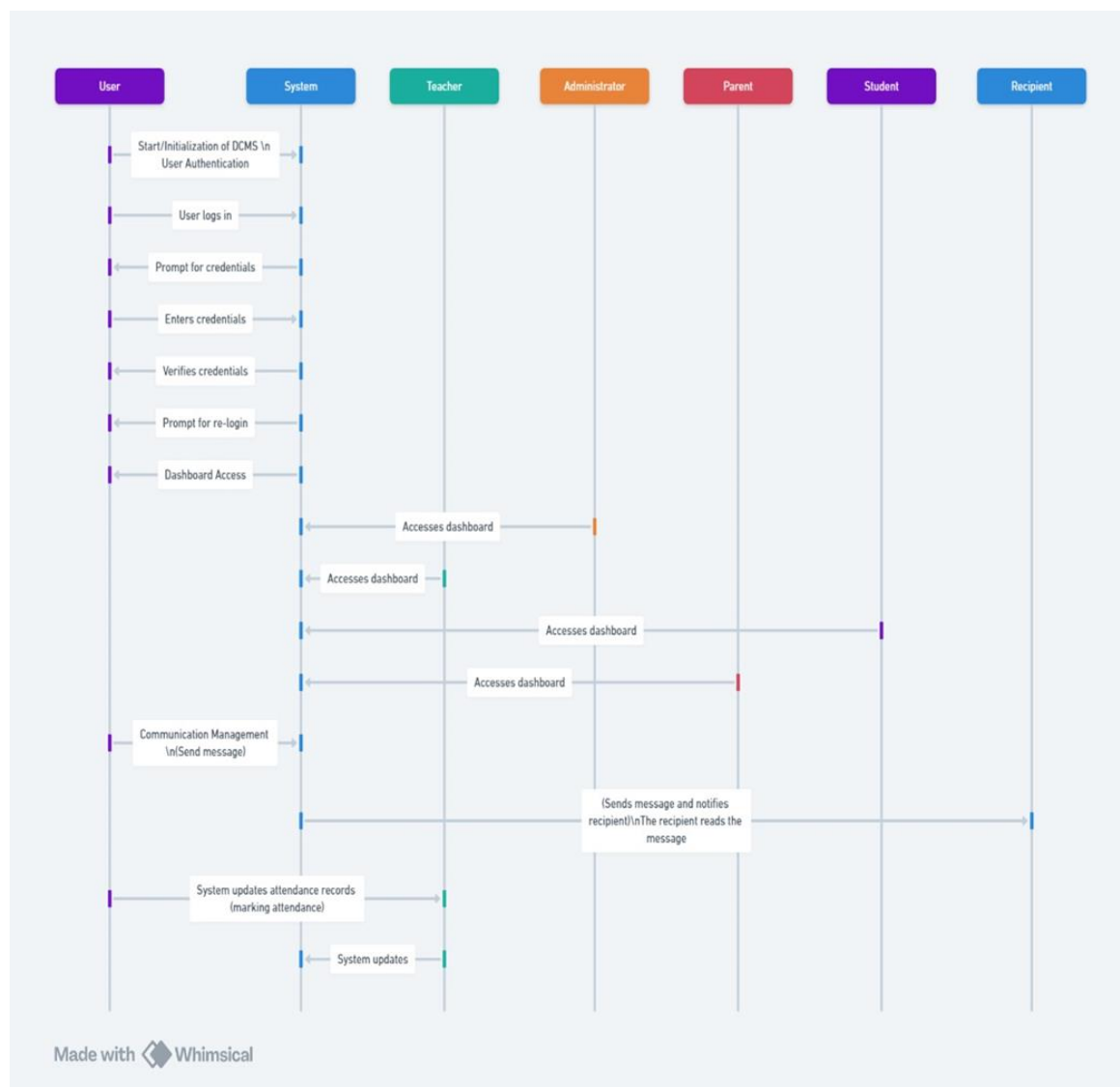
Figure 2. UI design