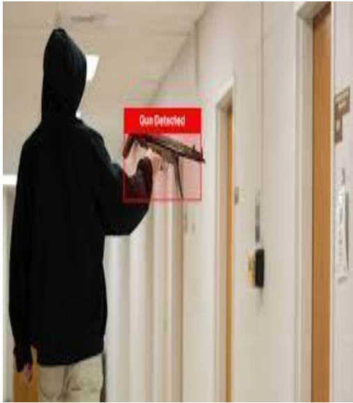
Fig :3 Gun detection using YOLO and RCNN