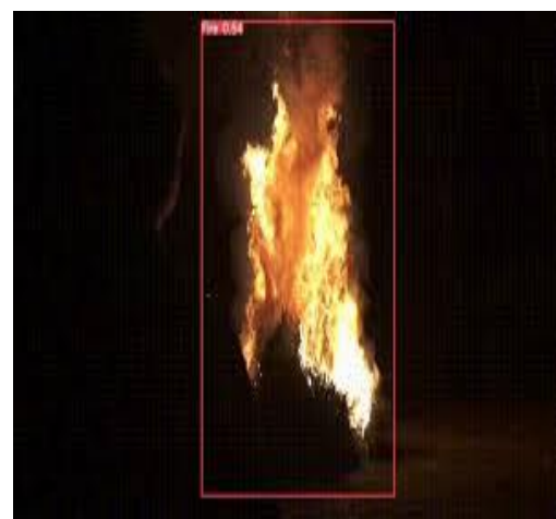
Fig :2 Fire detection using YOLO and RCNN