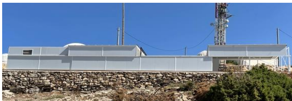
Figure 3 Image of the southern slope of AstroCamp hosting in Nerpio (Spain).

be controlled remotely. In the right area of the image, there is a room (entrance) to house the control systems. This room is independent of the whole observatory.