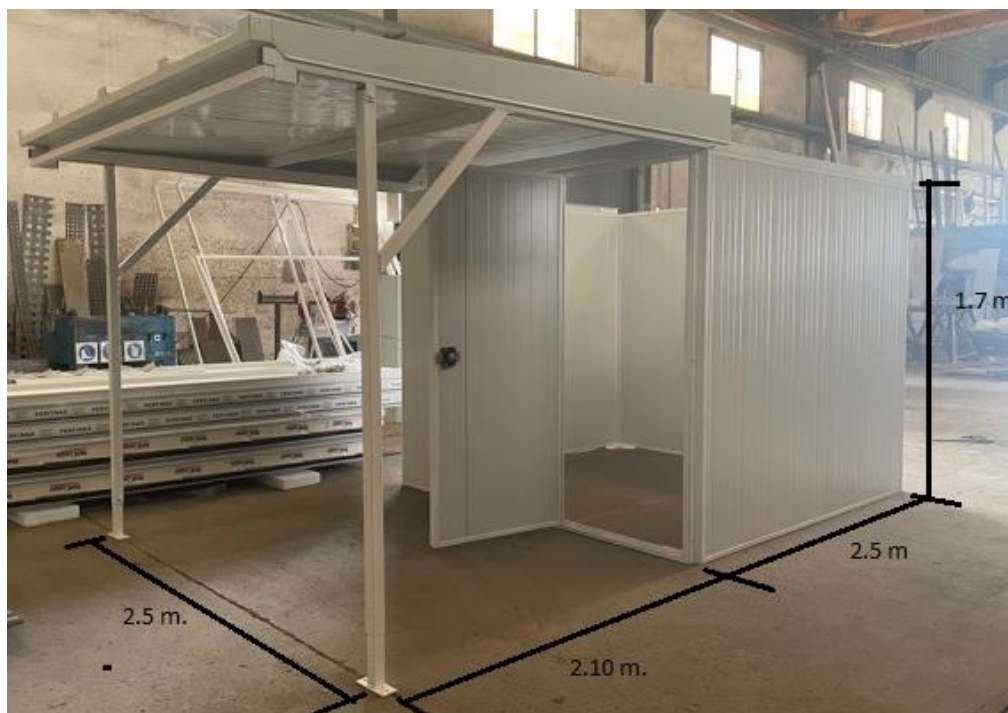
Figure 4. Image of the robotic observatory ProAm 2.5.

ROA's ProAm models have been developed with the aim of achieving a small, inexpensive observatory that can accommodate small telescopes [9]. The purpose of the ProAm models has been to offer a solution for small-scale research projects and to offer a solution for projects that need to have an ROA network.