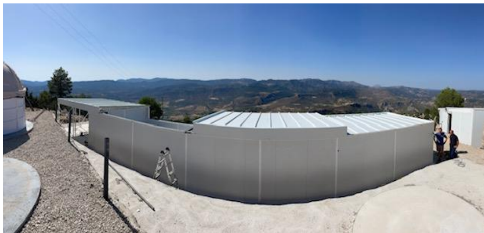
Figure 2. Image of AstroCamp hosting with an open roll-off roof (right). The roof on the left is closed.

Having a large space to house telescopes means considerable savings in facilities and automation. In this case, a separate room has been included, where the control systems and PCs are located. This makes it possible to control more than ten telescopes from one place.